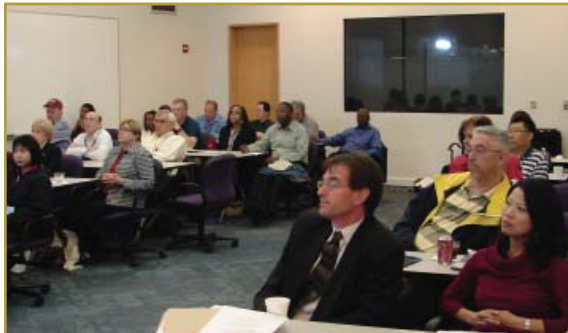
Audience at one of our chapter workshops

The Montgomery/Prince George's County Chapter serves professionals in the government financial management community by providing quality education, fostering professional development and certification, and supporting standards and research to advance government accountability in the Montgomery County and Prince George's County areas. The Chapter mission is to provide or sponsor appropriate educational programs, encourage professional development, influence governmental financial management policies and practices, and serve as an advocate for the profession.