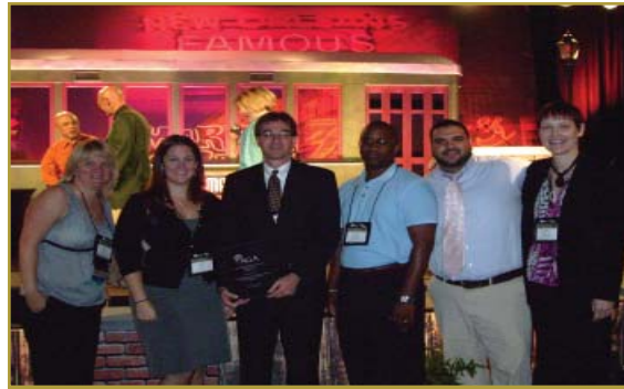
Chapter Board members at the AGA's National Conference