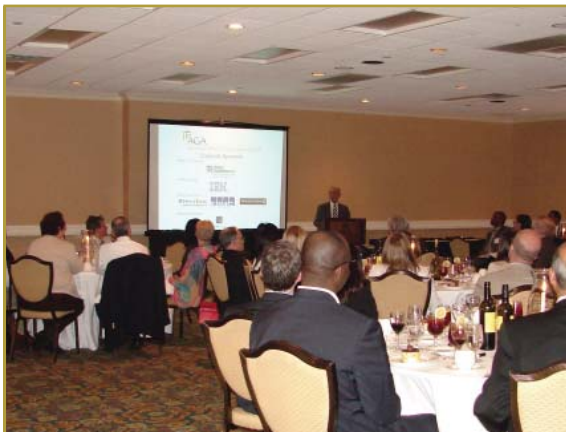
Attendance at one of our monthly dinner meetings

To add a Montgomery/Prince George's County Chapter affiliation to your AGA membership, please contact AGA National at 703.684.6931.