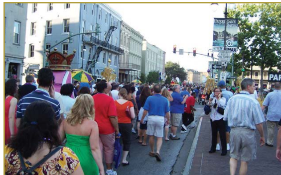
AGA members at the AGA's National Conference in New Orleans